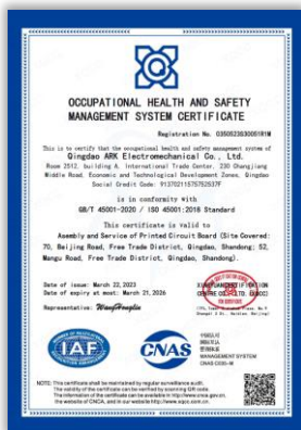
GB/T 45001-2020 ISO 45001 : 2018

Since our founding, our reputation has been built on quality. In our pursuit of excellence, we are relentless. We deliver original, cost-effective solutions at scale. With a zero-tolerance policy for defects, our teams continually raise the bar for quality. Having earned multiple ISO certifications, we hold ourselves to the highest industry standards.