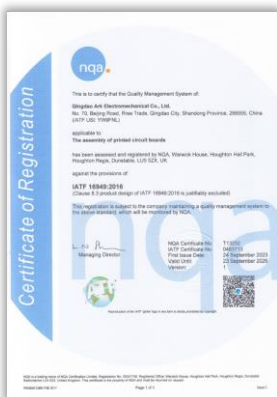
IATF 16949 : 2016