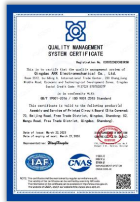
GB/T 19001-2016 ISO 9001 : 2015