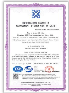
ISO/IEC 27001 : 2022